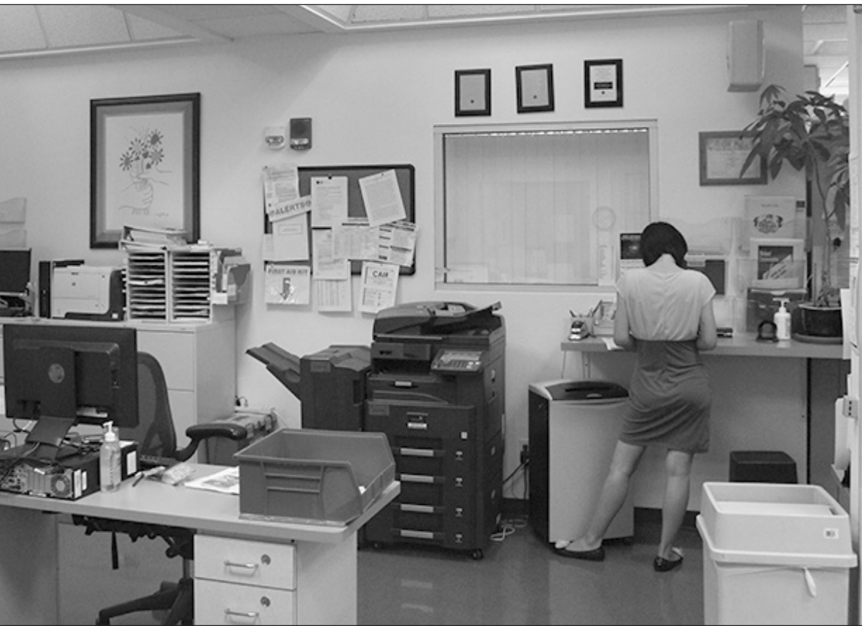
First aid: The Student Health and Wellness Center employee is looking over at some paper work. The Student Health and Wellness Center recently teamed up with Campus Police to put together a flier with a list of all the different services that both provide on campus is called “Stay Falcon Safe!”