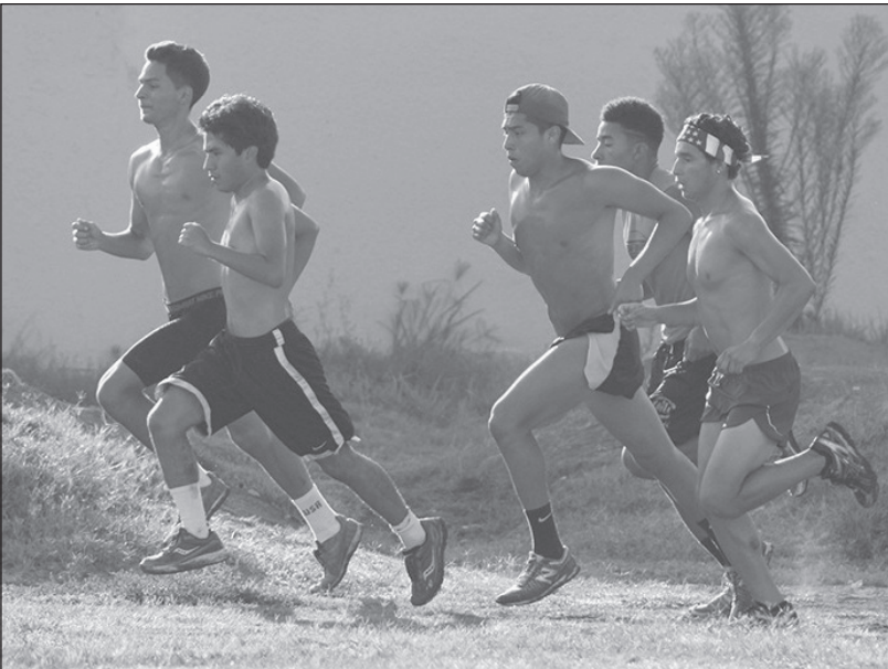
Men's cross country: Men's cross country prepares for its first event this Saturday at Carbon Canyon Park. The team held practice last Friday at Excelsior Track.