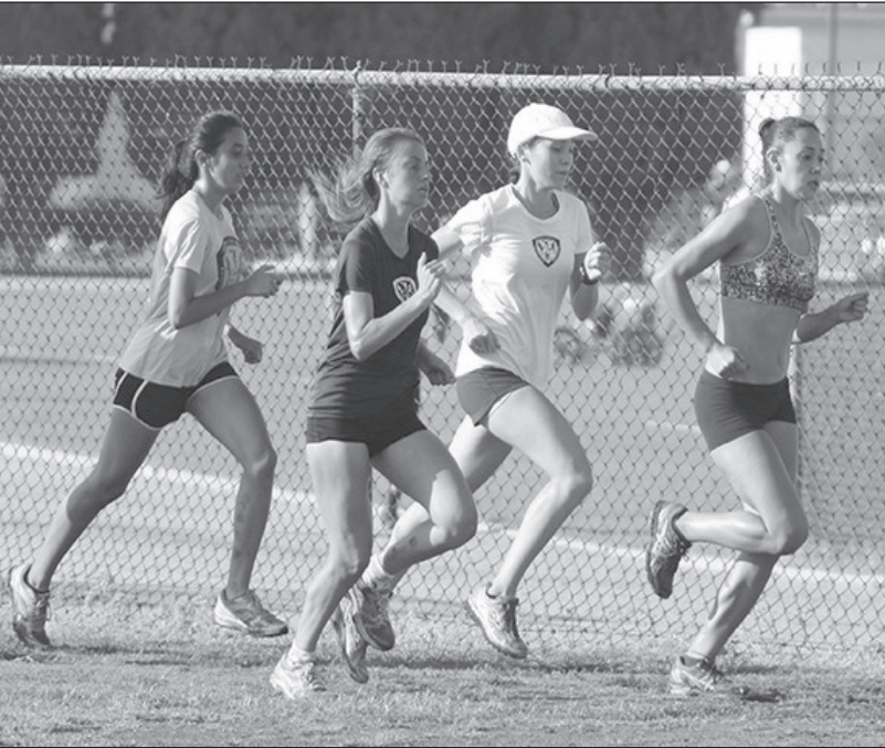
Women's Cross Country: Last Friday the women cross country team held practice at Excelsior Track. The women open their season on Saturday at the Mark Convert Open.