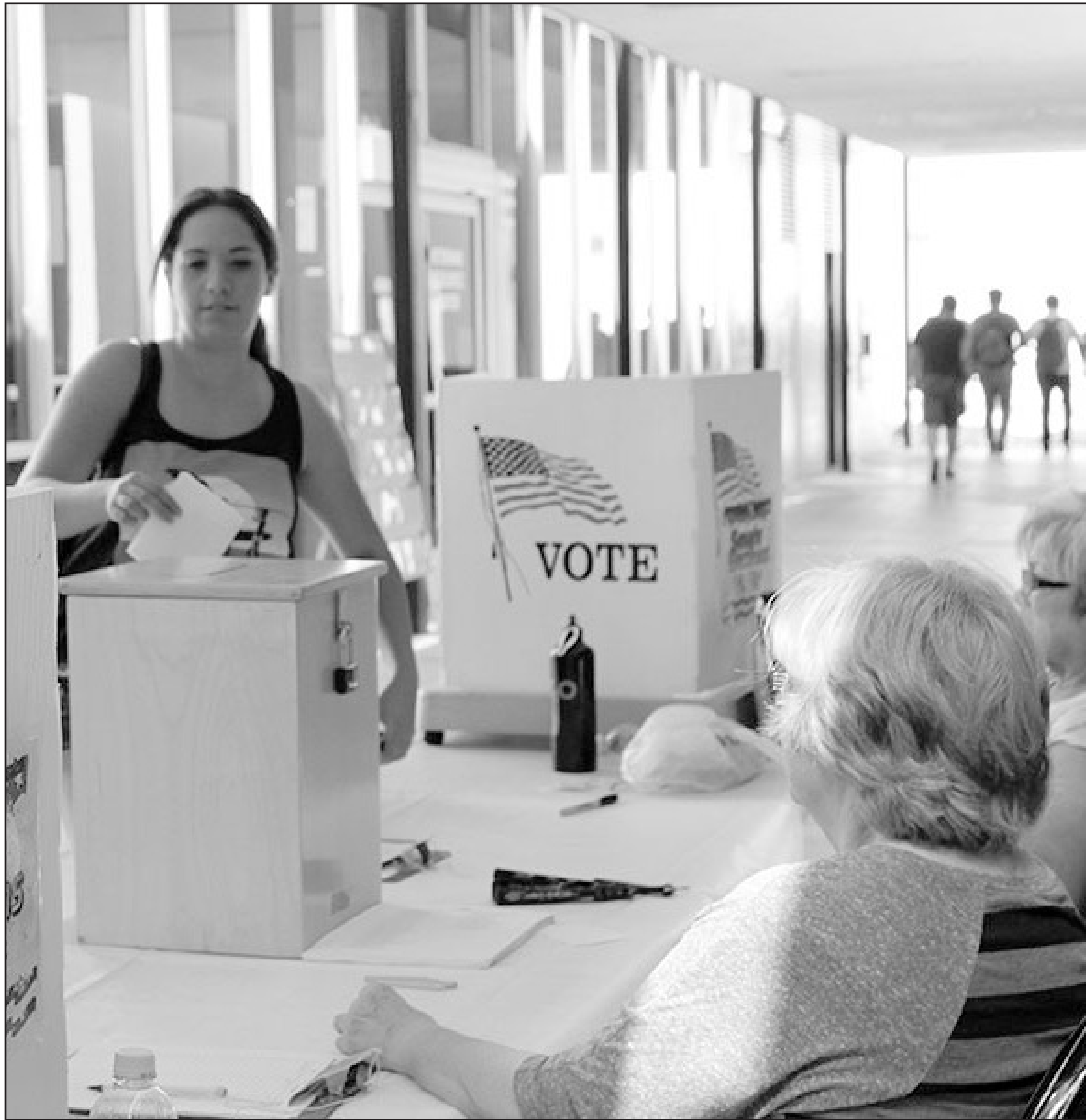
A rise in vote turnout: Student submits ballot at the voting booth located near the front of the Student Center. The students felt voting was important in helping improve the ASCC Senate.