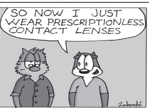
For more comics visit FilbertCartoons.com