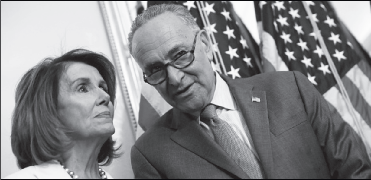
Busy at work: Democratic leadership discuss the Child Care For Working Families Act

Here is what we can do, we can sit back and let the artist tell us what to do. Or we can have the choice to do what we want since it’s our money, our experience.