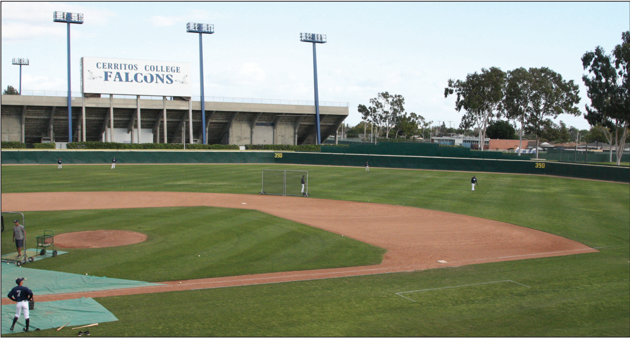
Light less field : The Cerritos College baseball team has had a hard time this season as a lack of lights has been affecting games. Games have been postponed as a result.