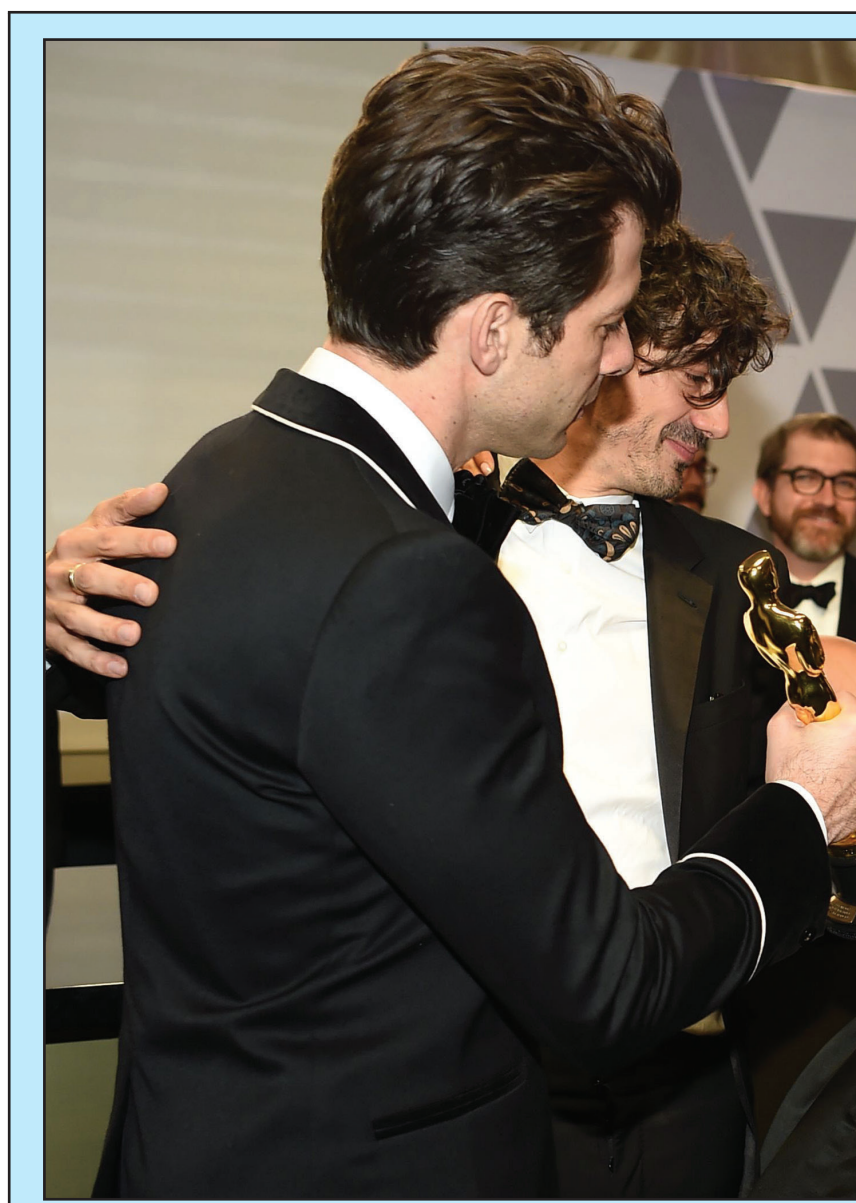
A Star is Born winners: Best Original Song was "Shallow" from "A Star is Born" by Lady Gaga and Bradley Pitt. They attended the 91st Annual Oscar's Academy Awards Governors Ball at the Dolby

'Gucci Gang' rapper debut album: Rumors being that he dropped out of Harvard University, he put it to use in each song on how school is not a priority. 'Harverd Dropout' was released on Feb. 22, 2019.