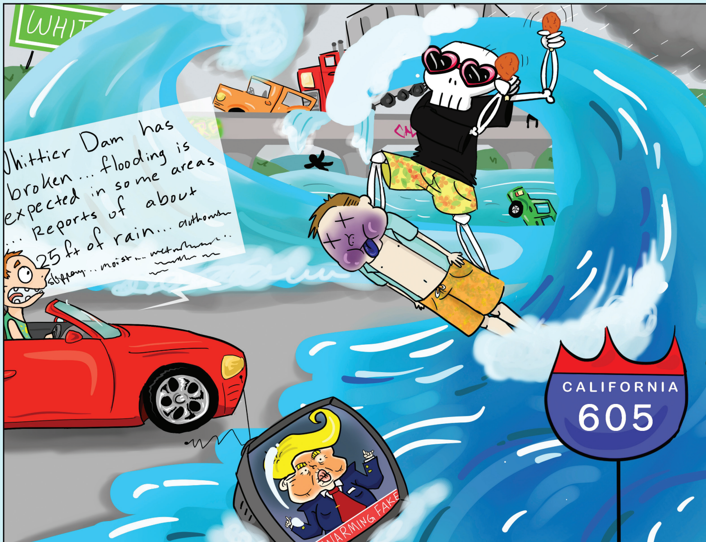
SOFIA GALLEGOS/FREELANCE ILLUSTRATOR

In past years ice caps have begun to resonate back to their liquid state and sea levels are infinitely rising due to climate change.