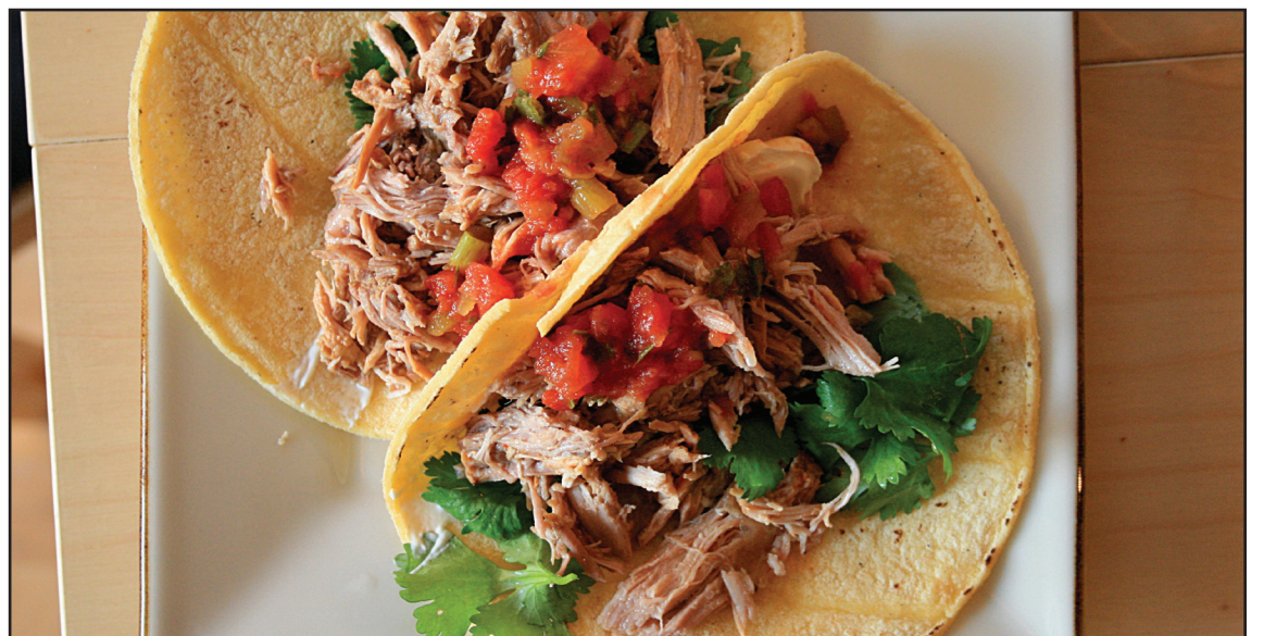
Mex'cellent: East LA taceria, Los 5 Puntos, offers a variety of toppings to cover up the traditional tacos. On Feb. 25, the eatery offered excellent carnitas that are worth the drive and price, they are a must-try.

Next time you're in East LA, make sure to check out Los 5 Puntos for freshly-made, authentic meals.