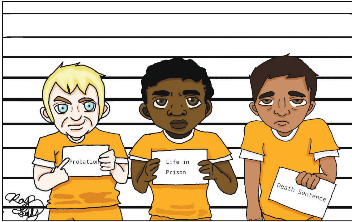
RACHEL TULLY/FREELANCE ILLUSTRATOR

Instead they'll create a convenient narrative of how this in-