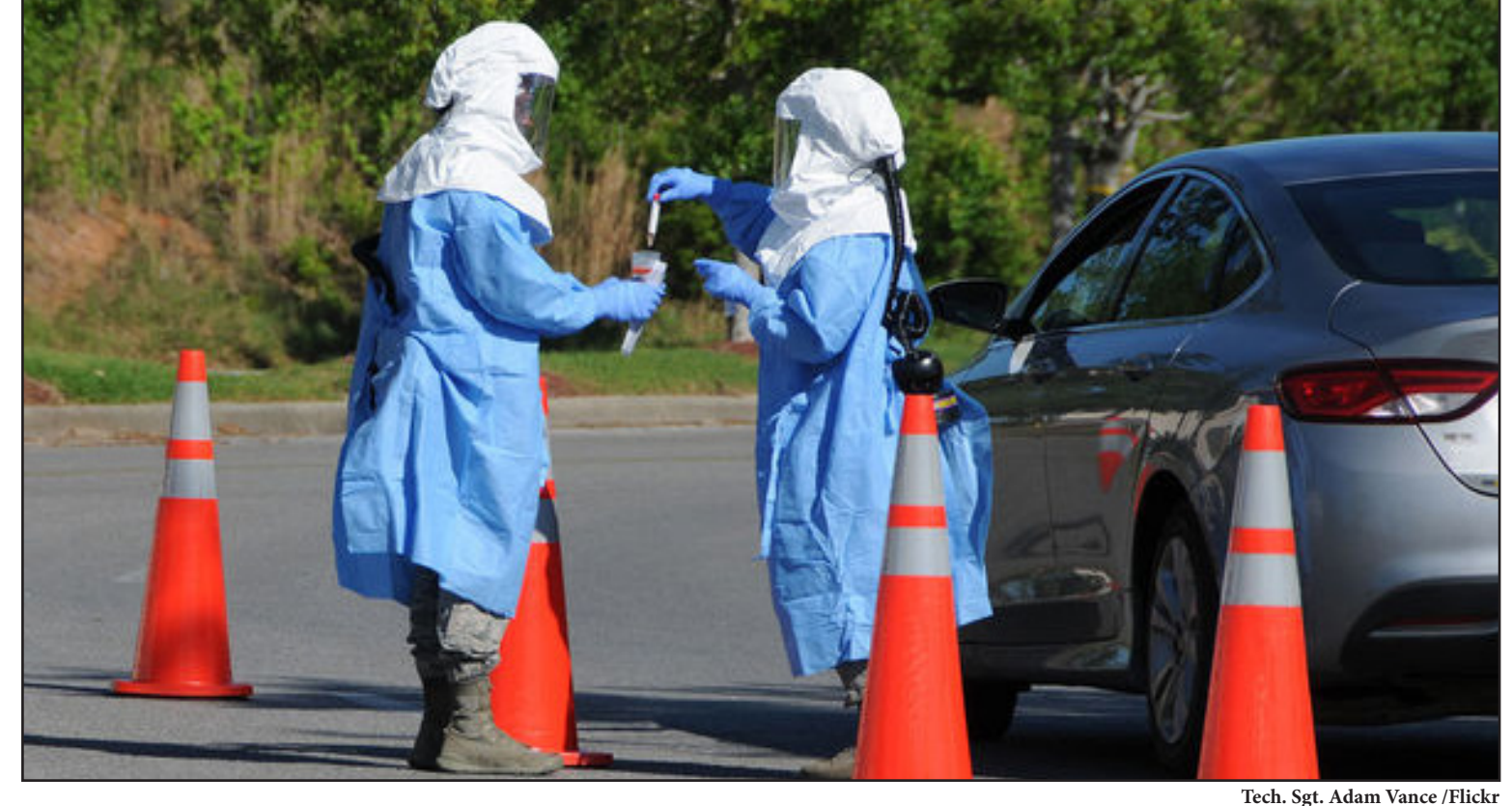
Free Testing: Airmen with the 186th Air Refueling Wing administer COVID-19 tests at the Bonita Lakes mobile COVID-19 testing facility on April 1, 2020.

When residents book their appointment, they will receive a