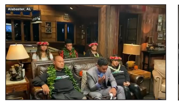
Sports - Page 12 NFL virtual draft

"Many of our faculty and staff administrators are not used to working in this type of environment," Fierro said.