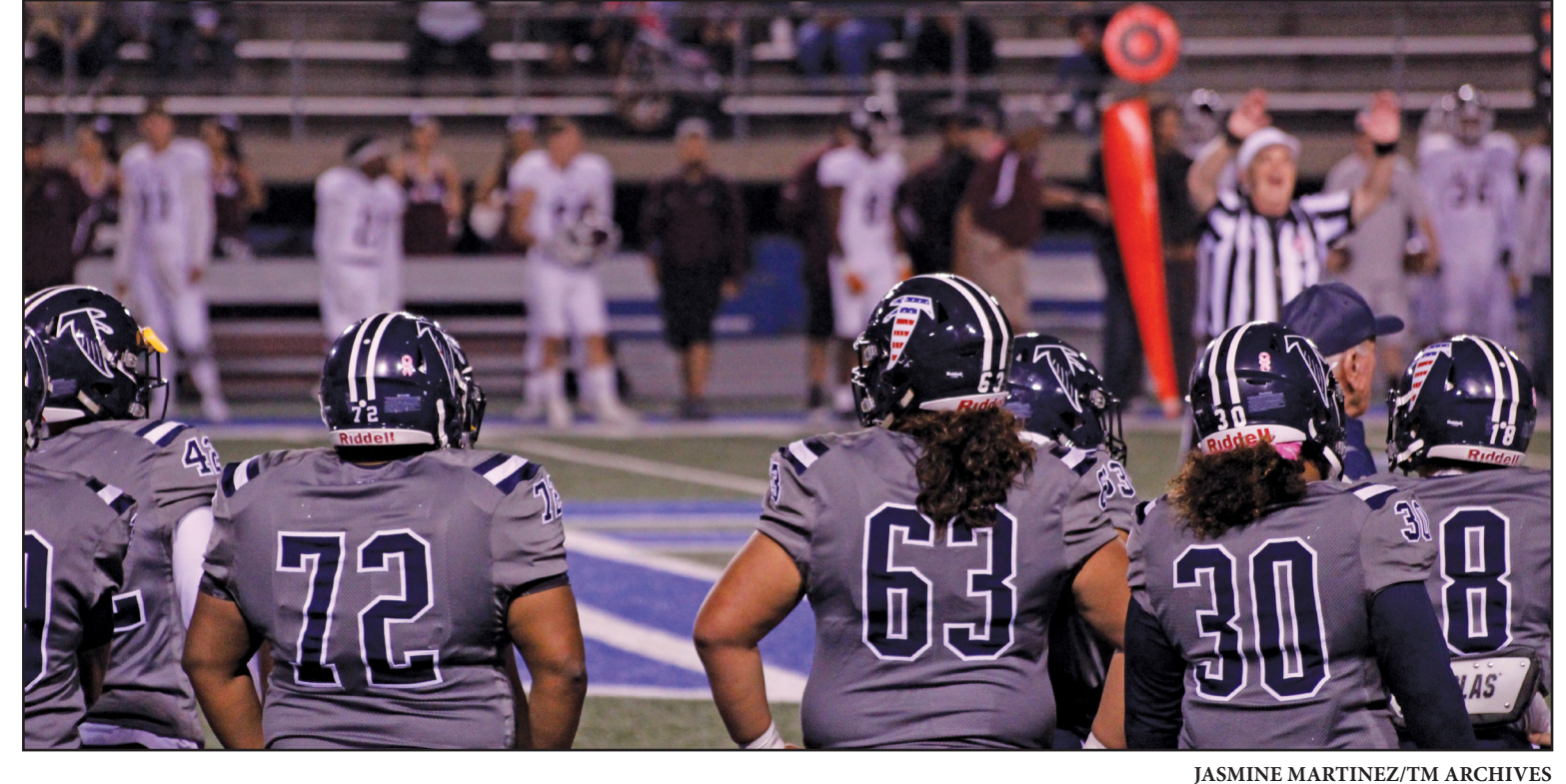
Game on: Cerritos College football team members watch the action from the sidelines. They wait for their opportunity to get back on the field Nov. 2, 2019.

"I've been conditioning every day and weight training when I can, usually 2-3 times a week,"