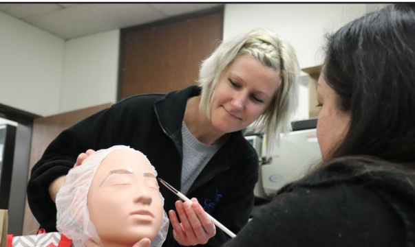
A & E - Page 6 Teaching beauty online