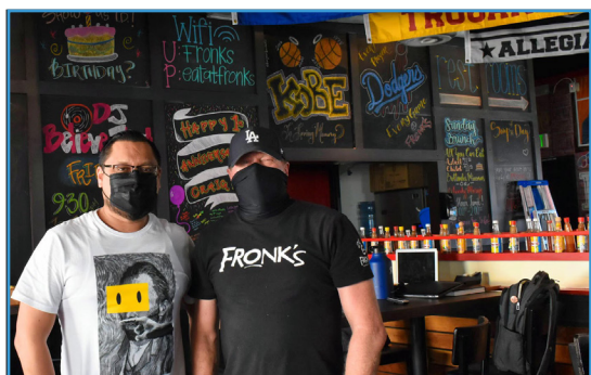
Community-page 3: Restaurants re-open

According to the official COVID-19 site for California, 7, 437, 925 vaccinations have been administered as of Feb. 22. Out of those, 1,827,609 were received and administered in Los Angeles County. Another 9,857,175 have been divided and shipped to the various counties for