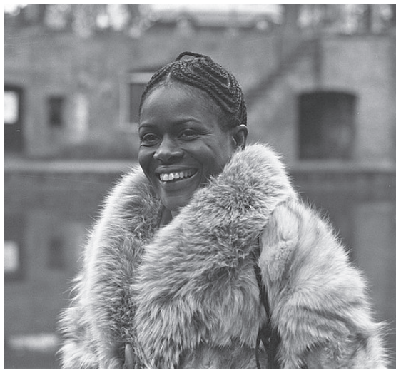
American film star Cicely Tyson during press conference in Utrecht, 1973. Tyson's memoir "Just As I Am" describes some of her struggles as a Black woman in Hollywood.