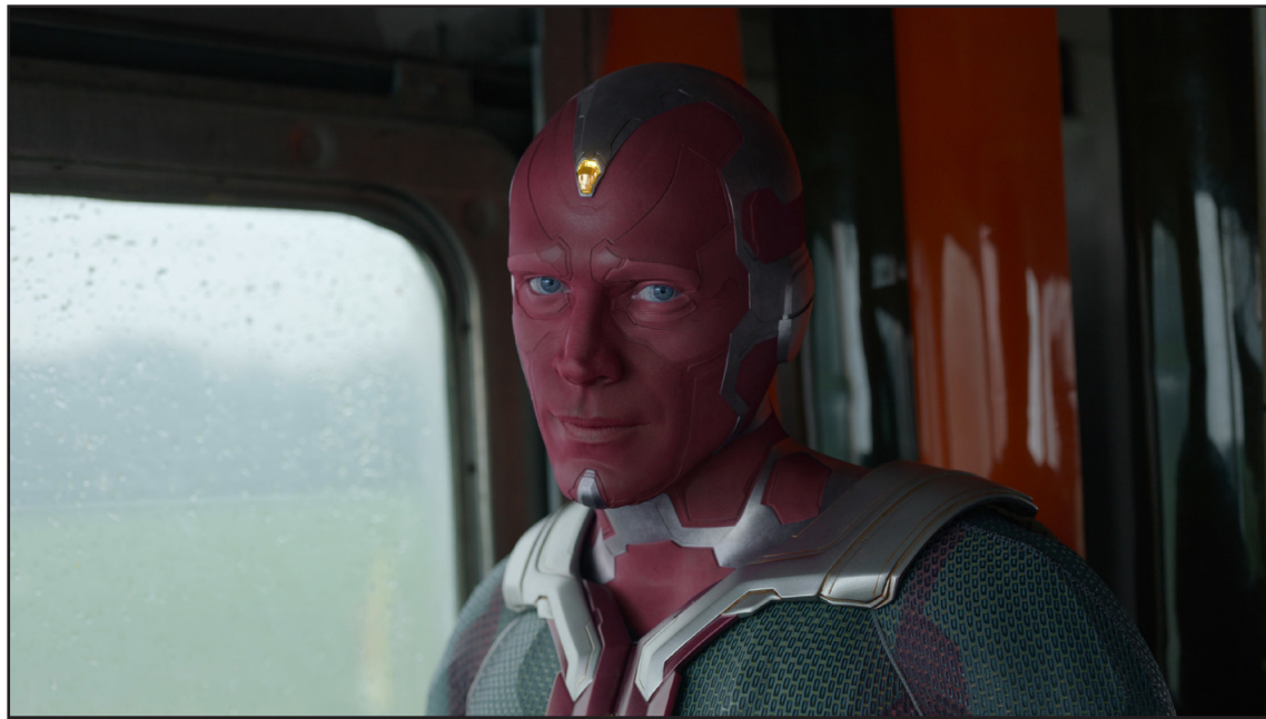
Vision: Paul Bettany is Vision in Marvel Studios' WANDA VISION, exclusively on Disney+.

wakes up from last night being in the middle of a Circus with a bunch of S.W.O.R.D agents turned circus performers.