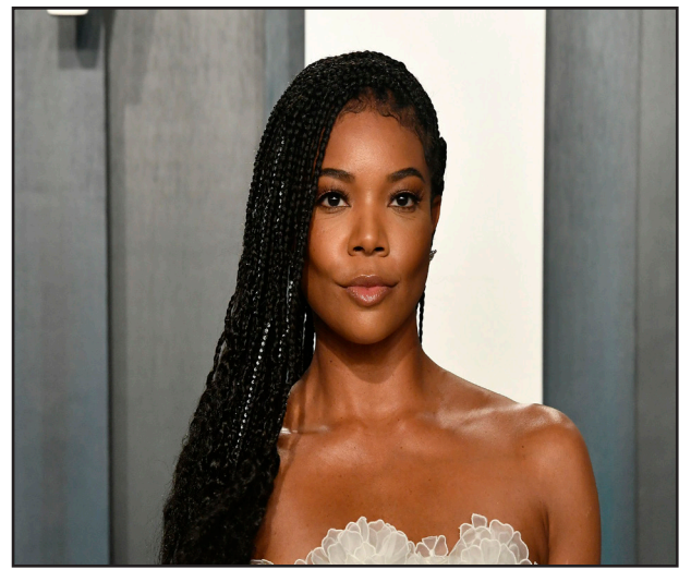
BEVERLY HILLS, CALIFORNIA - FEBRUARY 09: Gabrielle Union attends the 2020 Vanity Fair Oscar Party hosted by Radhika Jones at Wallis Annenberg Center for the Performing Arts on February 09, 2020 in Beverly Hills, California.

Black women are becoming a more prominent part of the entertainment industry, yet they still face discrimination on movie sets. Unfair treatment range from their hair, makeup, negative stereotypes to completely silencing their voices in the film world.