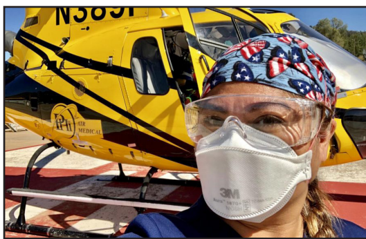
Life-page 5: Nurses talk emotional toll