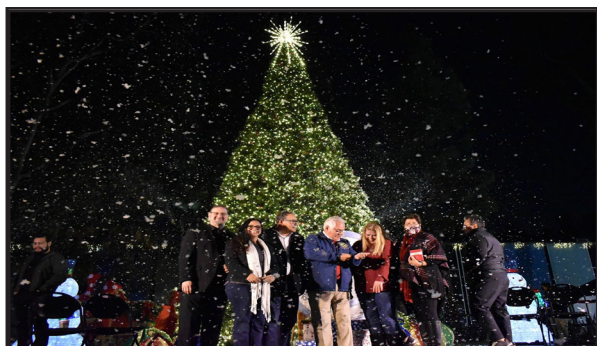
Community pg. 3: Norwalk gets lit