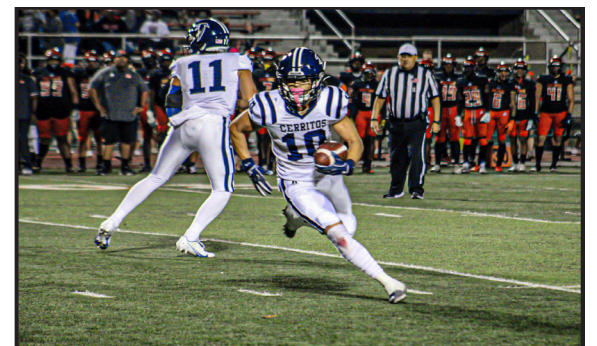
Sports pg. 7: Falcon football recap