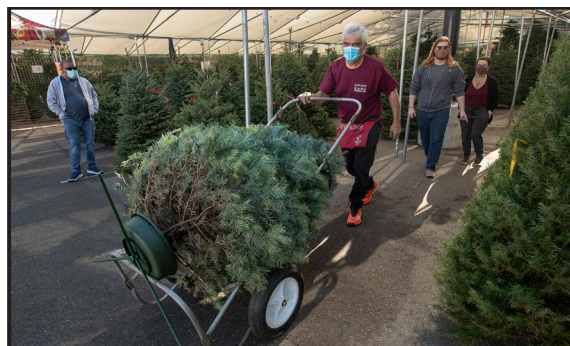
Opinion pg. 6: Hazardous holidays