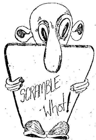
Henry (See Page 2)

adopted to speed up the service and therefore accommodate more people. All items and prices are listed for easy selection. Other schools are reported to have successfully made this method work as Cerritos hopes to do.