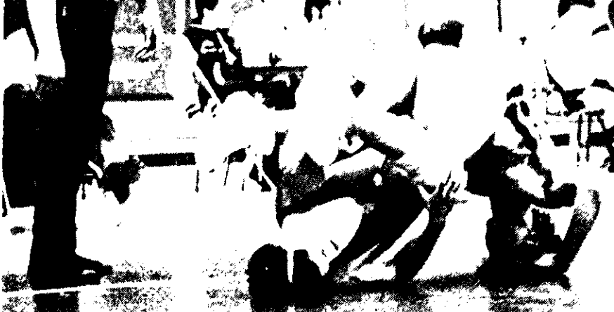
FROM A NEW ANGLE - The Cerritos Wrestling squad opened the second half of the season yesterday at the Fresno Tournament which attracts nearly 40 teams. Results were unavailable at press time.