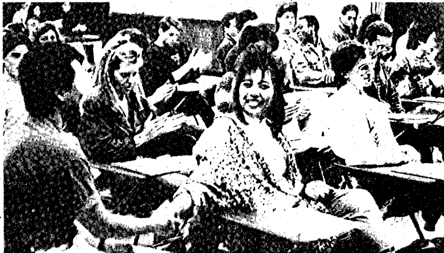
TM Photo By ANDRIA RATLIFF