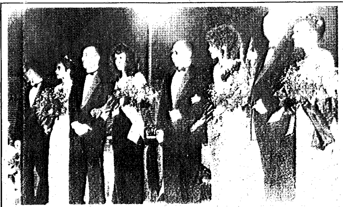
NEW COURT BEING SELECTED TODAY, TOMORROW

The Queen will be announced during the crowning commencement at the football game Oct. 10.